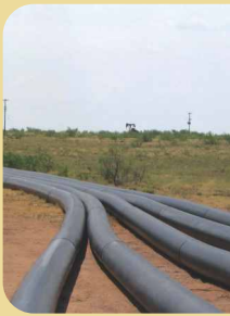
Pressurized sewer application