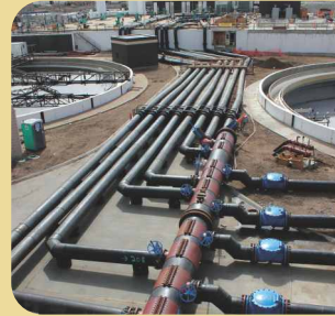
Industrial effluents application