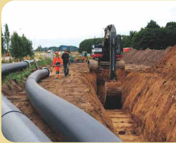
Underground sewerage application