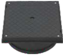
UltraGard - 315