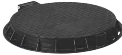
UltraGard - 450