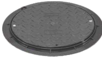
UltraGard - 355