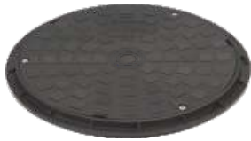
UltraGard - 315