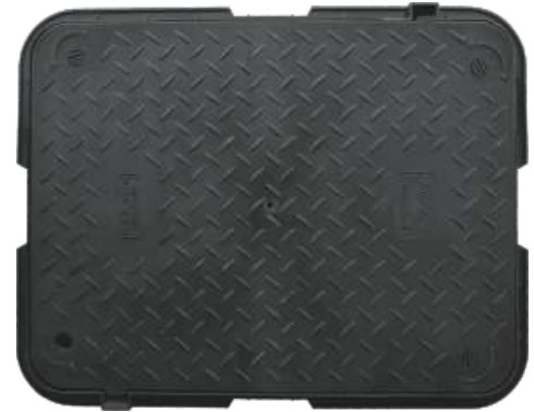
UltraGard 600 x 450